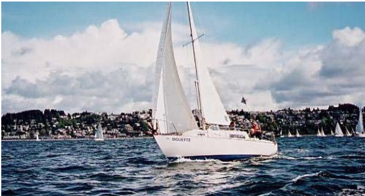
LMYC's Mouette in last year's Semiahmoo Bay Regatta