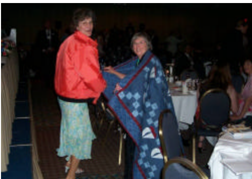
Happy auction winners