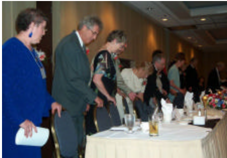
Bridge arriving at Head Table