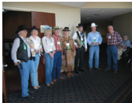
Vigilantes ready for action