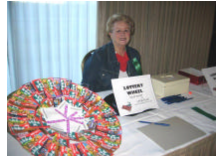
Lottery Wheel Marilyn