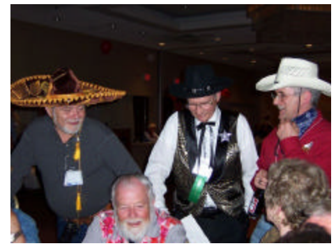
Keeping an eye on the game

For more pictures, go to http://www.whiterocksquadron.org/photogallery.htm