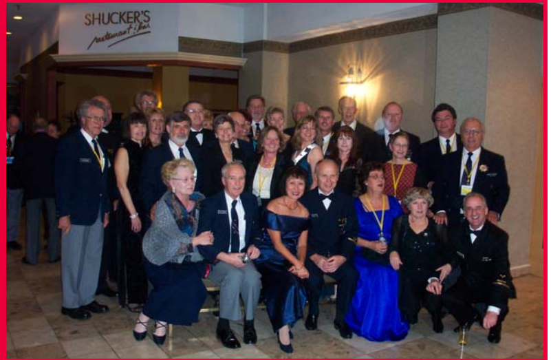
Group from Pacific Mainland District in Saint John