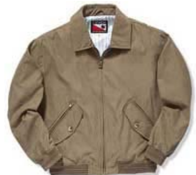
CPS Bomber jacket