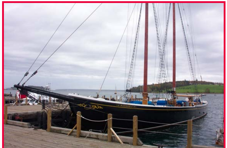
Blue Nose II at Lunenburg, N.S.