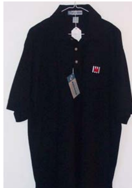
Navy blue golf shirt