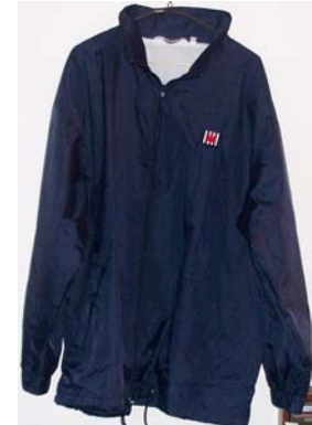
Navy blue jacket