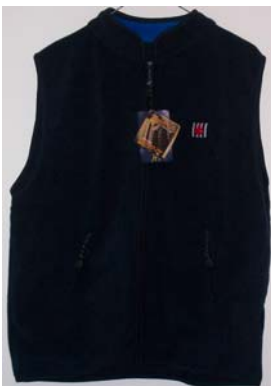
Navy blue fleece vest

For further information call the Squadron at 604-515-5566 or visit www.whiterocksquadron.org