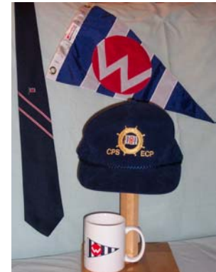
Tie, hat, mug, burgee