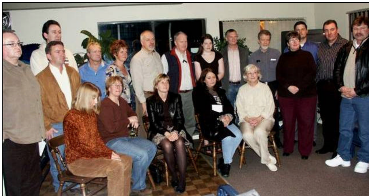
New and proud members of the Squadron, ready to take the member's pledge

For more pictures of the ceremony, click on http://www.whiterocksquadron.org/photogallery.htm